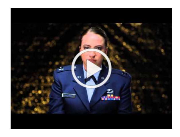
I'm Good. But are you ready to listen?