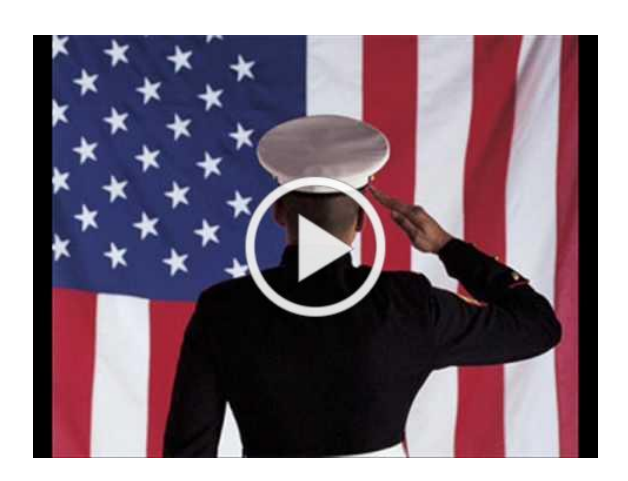
Lee Greenwood - God Bless the USA